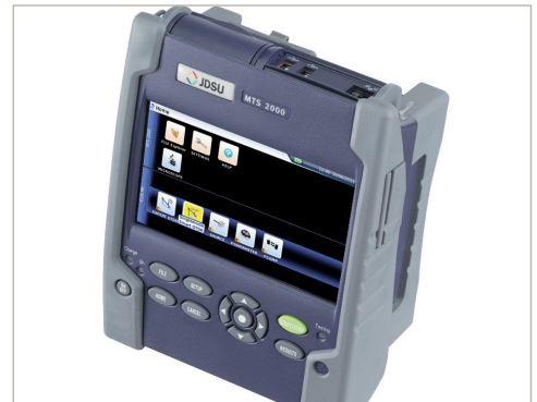
For more fiber testing and certification capabilities, combine the Certifier40G with one of the market-leading JDSU fiber testers, such as the T-BERD®/MTS-2000.

Visit www.jdsu.com/go/Certifier40G for more information, vendor endorsements, and product videos.