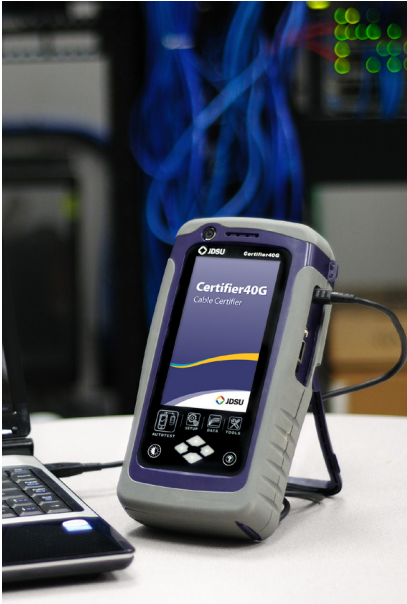
Complete PC desk-reporting software