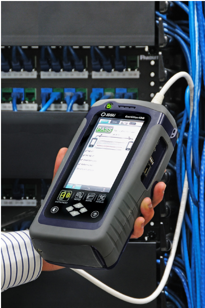
Easy-to-use large, graphical touch screen