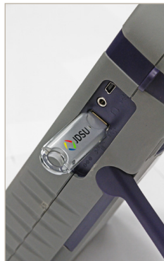
USB flash drive supports transferring test results