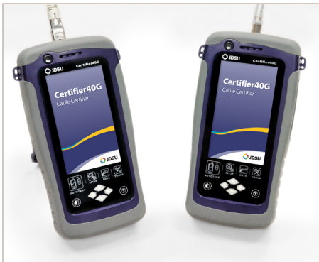
Two complete units minimize time initiating, naming, and saving results

*Please specify regional cables: North America (NA) Type A, European (EU) Type C, United Kingdom (UK) Type G, Australian (AU) Type I.